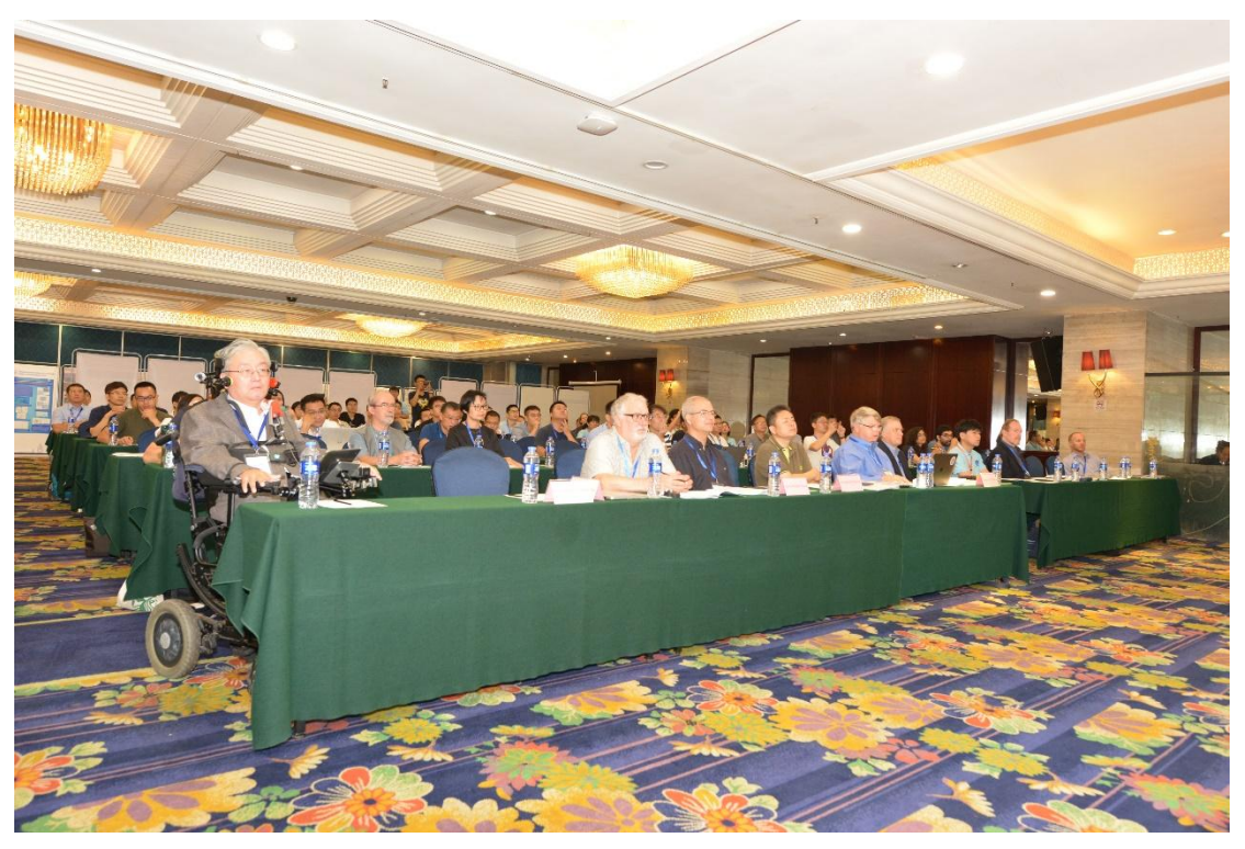
The main conference room